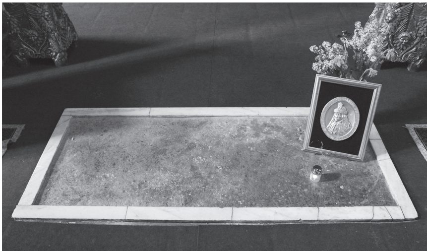
Fig. 2. The alleged tomb of Vlad the Impaler in Snagov.

the ruins, where there is an exhibition about Vlad's life. Of all the over thirty rulers who lived in the princely palace, Vlad is the only one whose life is exhibited specially. There are several information plates around the area where the information is in both Romanian and in English. 11 There are also at least three statues of Vlad the Impaler in the city, so it is made clear that he is a historical ruler whose connections to the city are remembered and appreciated.