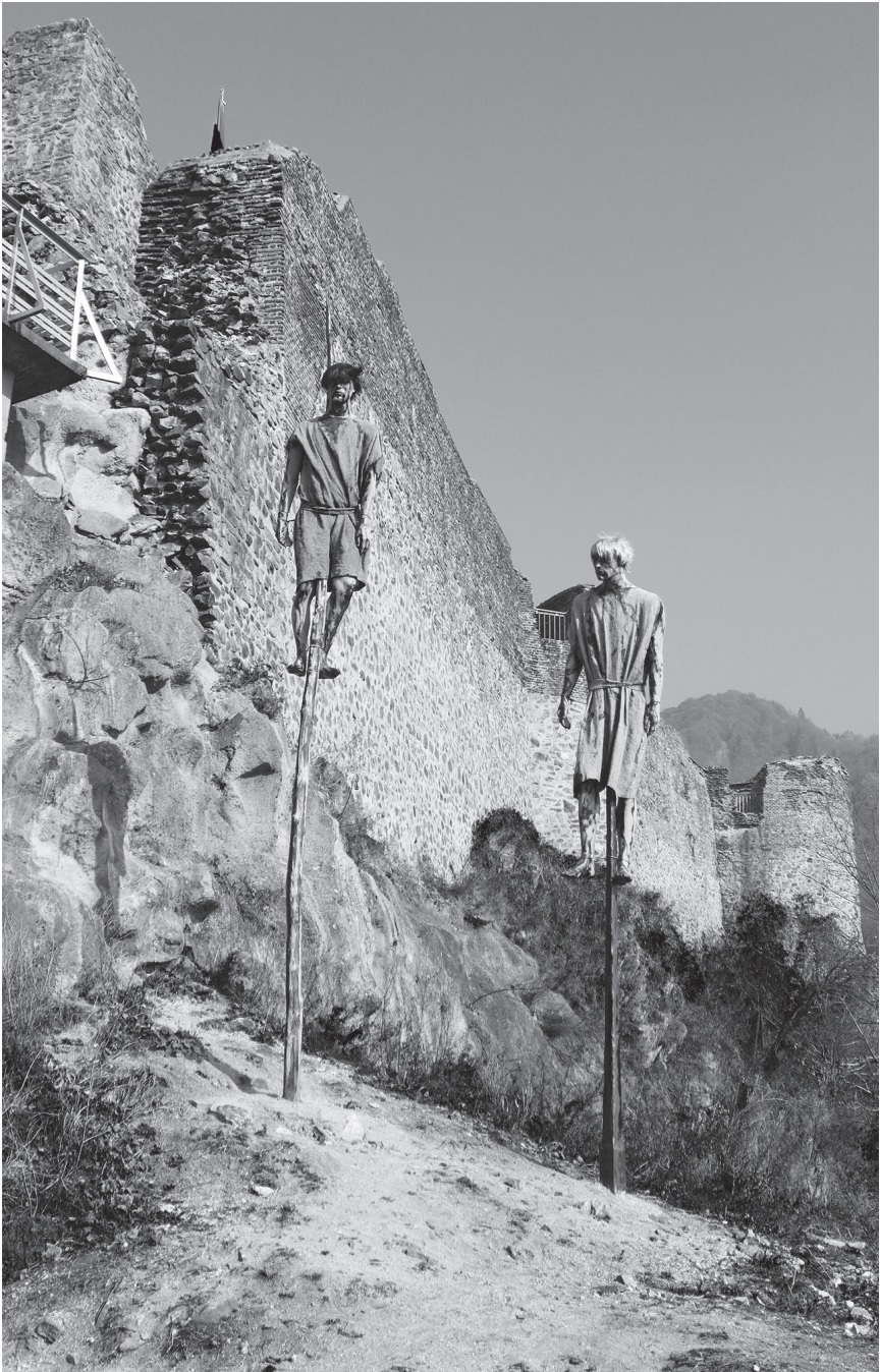
Fig. 3. Impaled 'victims' in front of the ruins of Poienari.