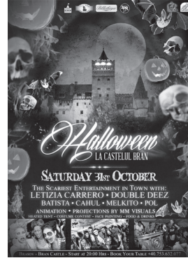
Figures 13, 14, 15. Advertisement posters for Halloween parties at the castle Bran.

by images of skulls, pumpkins and bats as well as pictures of people in Halloween costumes.