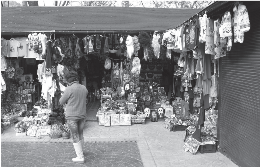
Fig. 16. A marketplace outside Bran castle.