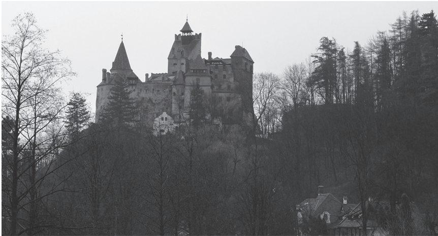
Fig. 4. The Gothic castle of Bran, standing on a rocky outcrop.

Count Dracula are explained. There is also one room where there are medieval looking costumes, one of which is 'Vlad's'. Other than that there is no mention of Vlad or Dracula anywhere in the castle, except the souvenir shop. There is a new addition to the normal interior in the castle, namely a torture room. Although the exhibition is a historical one showing historical torture devices, I feel that the reason they have added this exhibition could be seen as catering to Dracula tourists. Especially, since it is in stark contrast with the rest of the interior in the castle. Outside the castle there is a large marketplace, in which local people sell anything from local food products to T-shirts, coffee mugs and even Scream masks. 16 Bran is also full of restaurants and hotels and is clearly a popular tourist site.