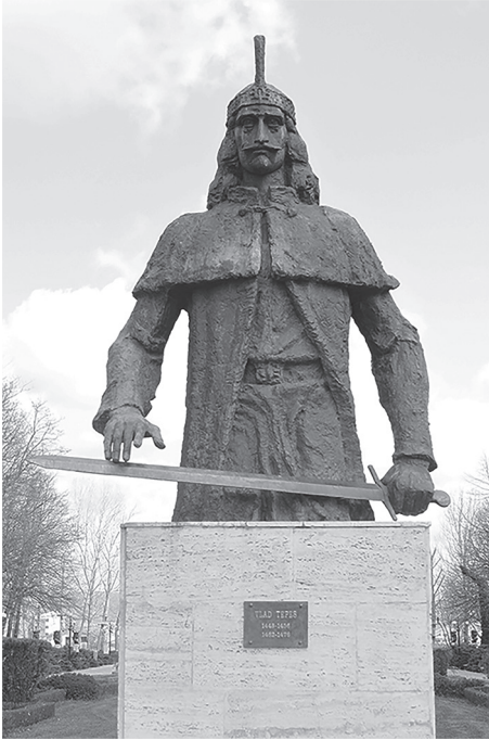
Fig. 1. A statue of Vlad the Impaler in Târgoviște.

the early twentieth century the image of Vlad was that of a cruel but just leader who, although he did terrible things, always had a reason to do so (Light 2007). For some reason the use of the image of Vlad the Impaler in politics by the far-right in Romania during the 1930s and 1940s has often been overlooked whereas the Communist party's use of his image is widely acknowledged. Vlad must have been looked on positively in order for a political party to use him in its campaigns. The most famous far-right movement was the Legion of the Archangel Michael, which later became the political party the Iron Guard. One book that was considered standard reading within the movement described and idolised a nation with a strong leader who