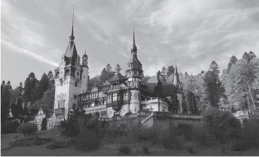
Fig. 12. Peleş Castle.

We show to everybody Castle Bran because a lot of foreigners consider this is the vampire castle, doesn't matter [that] Țepeș was not there, and there is no connection. But we try to explain: no, it's not a vampire castle, he was not here, we have no vampires, but they don't believe us anyway. 60