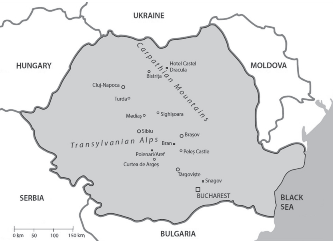
The Map of Romania. Pekka Tolonen 2014.