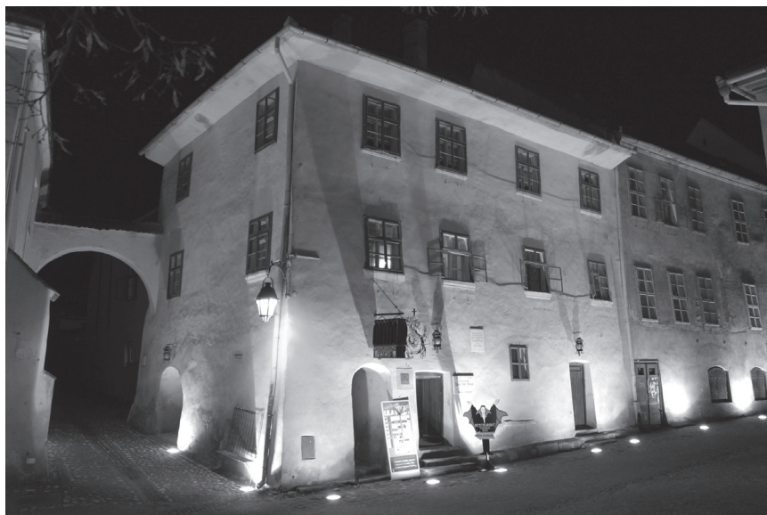
Fig. 9. Vlad Dracul House in Sighișoara. The alleged birthplace of Vlad the Impaler. Photo: Tuomas Hovi (2010).

not really form a coherent narrative space, however, because the narratives used there are too fragmented and the references to the theme of the tour are too vague to form a coherent narrative space out of the city.