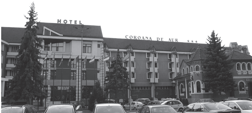
Fig. 11. The Coroana de Aur (Golden Crown) hotel in Bistrița.

The place myth of Transylvania is used in tour narrations clearly in the way the tourist's presence in Transylvania is constantly highlighted and emphasised. Tourists are told that the many crosses that can be found alongside the roads are there to protect them and that one should not wander beyond them. Similar things are told in the Hotel Castle Dracula, where tourists are warned not to wander around the hotel. They are also taken outside when it is dark and guided towards a campfire by a man dressed as Dracula. There they are offered a 'bloody' drink (in actuality țuică 48 ) and ghost stories are told. Sometimes there is also a 'ritual of the purifying fire' where tourists jump over a campfire