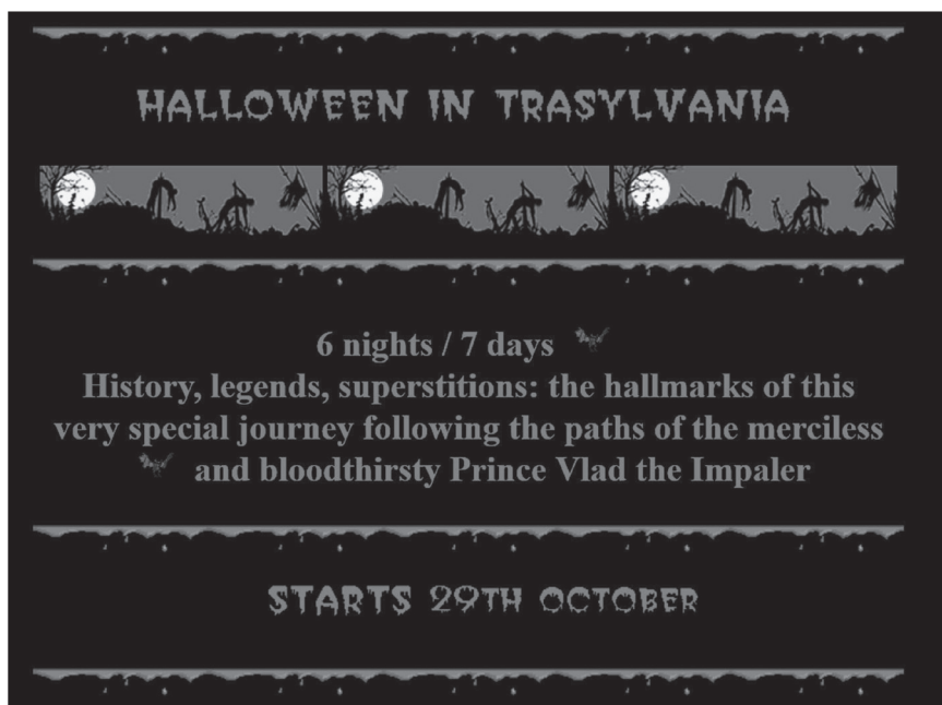
Fig. 6. Quest Tours and Adventures, 'Follow the Blood – Halloween in Transylvania'.

of Adventure Transylvania had one picture of the head of a vampire character with two wolves' heads, one on each side of it, and one picture of a carved pumpkin. The image of the vampire was taken from the 1991 movie Bram Stoker's Dracula . In 2014 they had removed all the other fictitious images with the exception of a shadowy figure holding a scythe on the page header picture. On the itinerary page of the Halloween tour, there was a cartoonish picture of a castle on a mountain top, some crosses, a witch flying on a broomstick and some bats flying around the castle with a large full moon on the background.