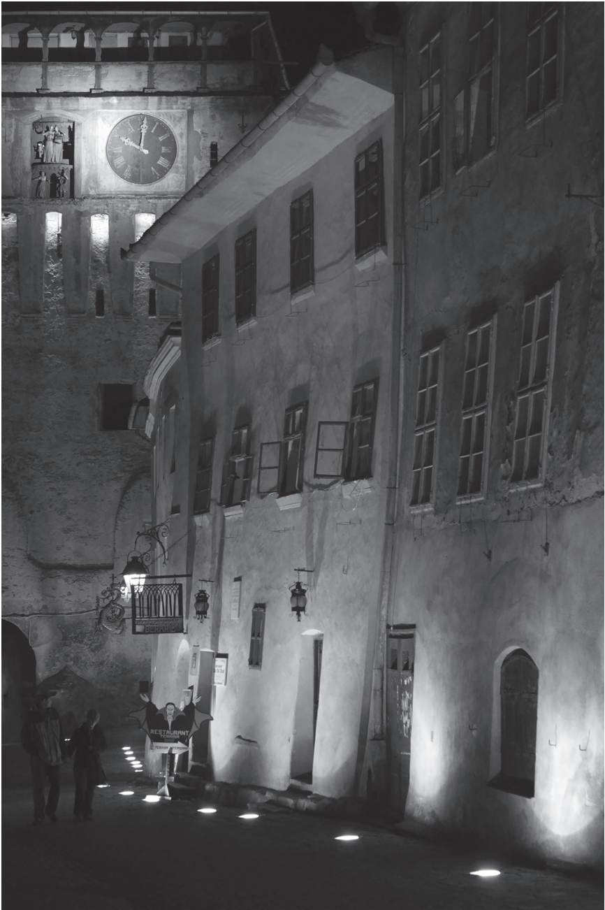
Fig. 17. Vlad Dracul House in Sighișoara. The alleged birthplace of Vlad the Impaler.