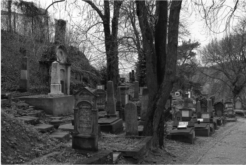
Fig. 10. The old German (Saxon) cemetery in Sighișoara. Photo: Tuomas Hovi (2010).

arm-wrestling competition. After the tourists ‘won’, they/we were knighted by a man dressed up as Vlad the Impaler. 29 In my opinion these mentions of the cruelties of the Middle Ages are told on the tours and mentioned in the websites for two reasons. Firstly there is a historical and cultural reason for referring to these kinds of events: these kinds of events really happened there. The second reason lies in the nature of the tours. Despite the lack of stories about Vlad the Impaler or the fictional Dracula in Sighișoara, the tour organisers can keep the atmosphere of the tours alive with these references to cruelty and death that took place at approximately the same time as Vlad lived.