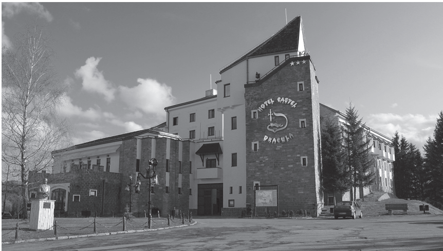
Fig. 7. Hotel Castel Dracula in Tihuța Pass ('Borgo Pass'). Photo: Tuomas Hovi (2010).

The intertextual reading of the Hotel Castle Dracula can also be said to be the main reason why many tourists are disappointed with it (Light 2009, 195). Because of the intertextual reading, or interpretation, the tourist is expecting to see the castle of Dracula that is known from books and movies even though many tourist brochures and tourist guides contradict this reading. When I interviewed the other participants of the Halloween tour in 2010, many of