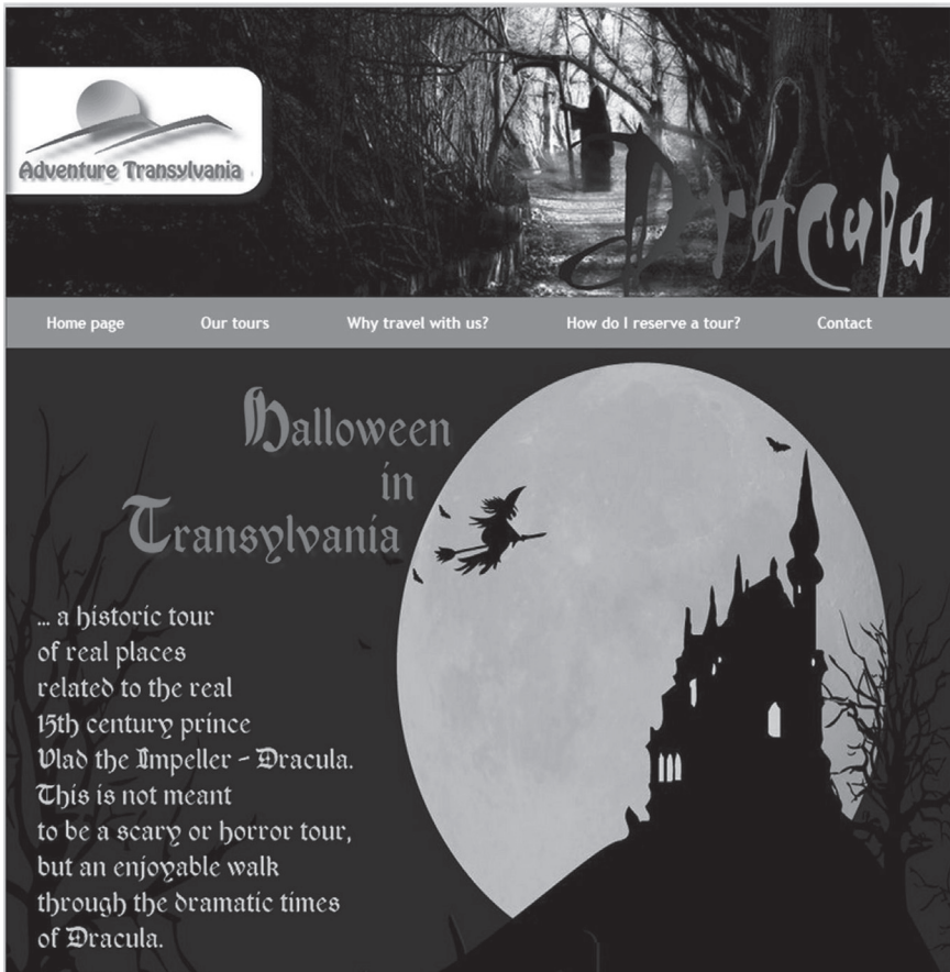
Fig. 5. Adventure Transylvania, 'Halloween in Transylvania'.

... the count is waiting for fresh ... friends!' Other than this the pictures on the website are from locations that are visited on the tours and some pictures from previous Halloween parties. The travel agency Visit Transilvania Travel does not have any popular culture imagery on their web pages. Go Romania Tours advertises some of their Dracula tours on their website with the picture of Christopher Lee as Dracula from one of the Dracula movies he made, with vampire teeth and blood dribbling from his mouth. This very graphic image of the vampire Dracula is, however, the only picture with any connections to the fictional character. The other images and pictures on the website are of places, buildings and activities that have historical or cultural value. 24 The main page